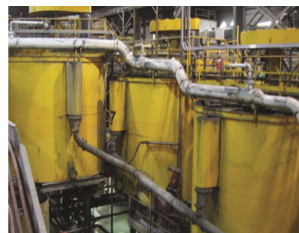
Mining & Mineral Processing