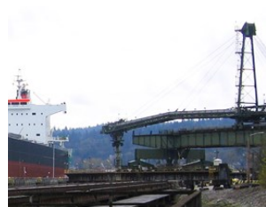
Ports & Marine